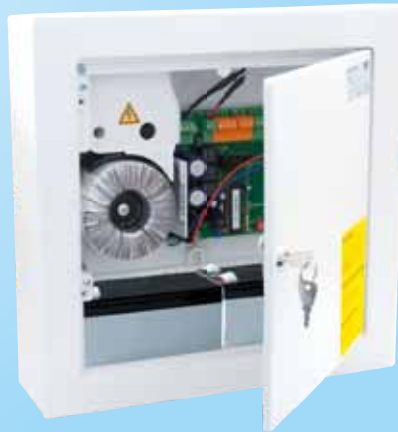
WSC 204: opens during smoke WSC 204BZ: closes during smoke