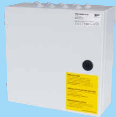
WSC 204MH: opens during smoke, steel housing