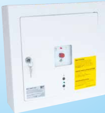
WSC 204KP: opens during smoke, with integrated breakglass unit and keypad